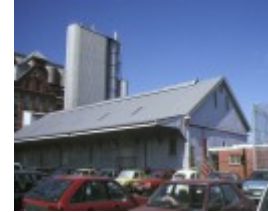
john darling & son flour mill albion delivery building