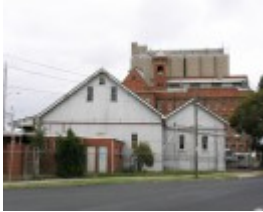
JOHN DARLING AND SON FLOUR MILL SOHE 2008