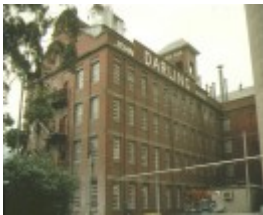
john darling & son flour mill albion front view