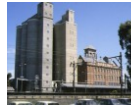
1 john darling & son flour mill albion view from railway line