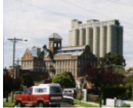
john darling & son flour mill albion view of property