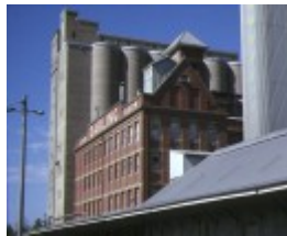
john darling & son flour mill albion silos