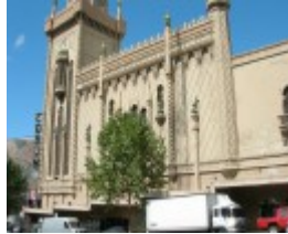
FORUM AND RAPALLO CINEMAS SOHE 2008