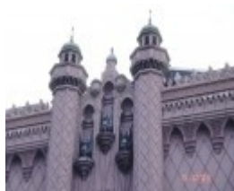
h00438 forum theatre flinders street melbourne flinders street statues she project 2003