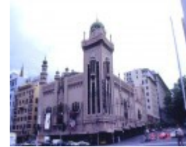
h00438 1 forum theatre flinders street melbourne external view she project 2003