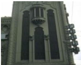
former state theatre flinders street melbourne external detail side sign