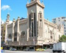
FORUM AND RAPALLO CINEMAS SOHE 2008