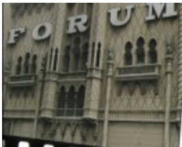
h00438 former state theatre flinders street melbourne front detail sign