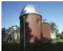
ballarat municipal observatory front view